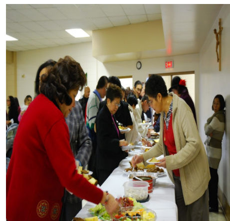
Pot-luck luncheon – Dec 2, 2007